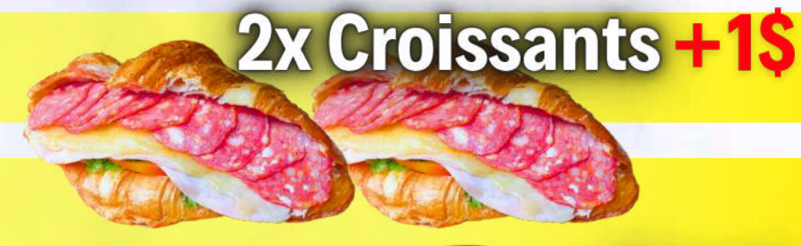
2x Croissants +1$

HAM & CHEESE 4.2$ Add Extra Ham+1.3$ Add Extra Cheddar+1.3$