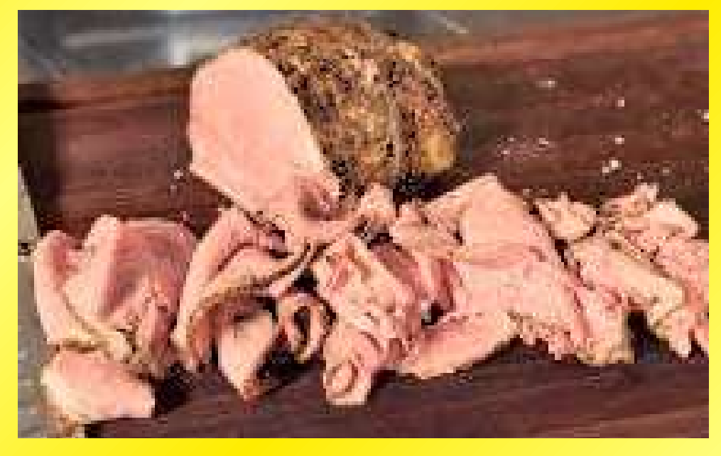
Roast Beef 9$/250g