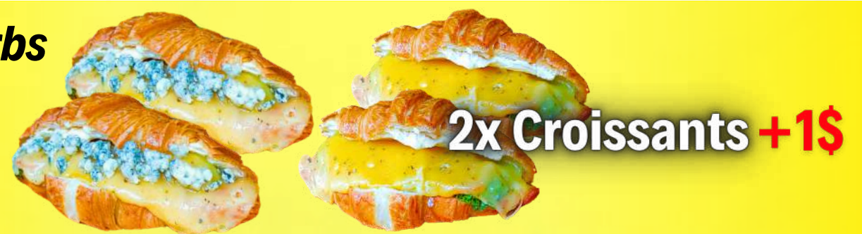
2x Croissants +1$

Add Truffled Salami+4.5$ Add any Meats+$