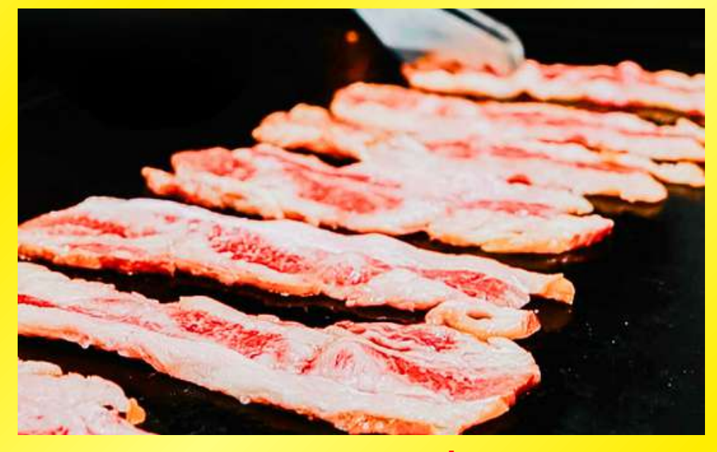
Beef Bacon 9$/250g Ask for Cooked or uncooked